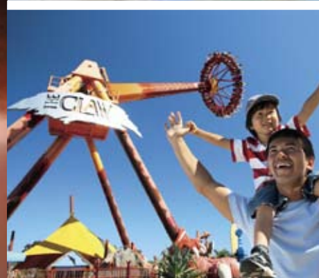
Fun time at Dreamworld