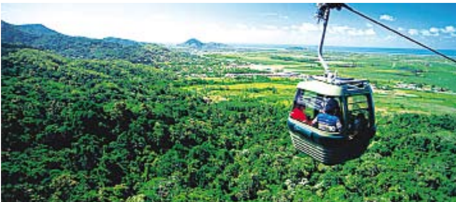
Scenic Cable car ride to Kuranda rainforest