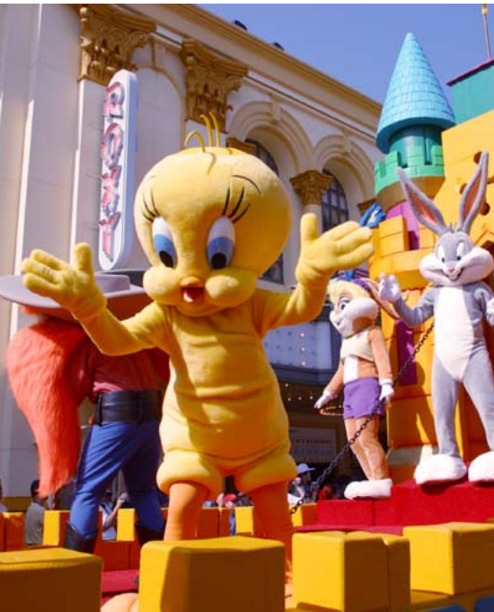
Meet your favourite toons at Movieworld

After a fun-filled day, return to the comforts of your hotel. Enjoy an Indian dinner OR You also have an option to opt for the spectacular Australian Outback show with dinner set in a giant 1000 seat arena with a cast of larger than life characters and amazing animals. Overnight at Paradise Resort or similar in Gold Coast.