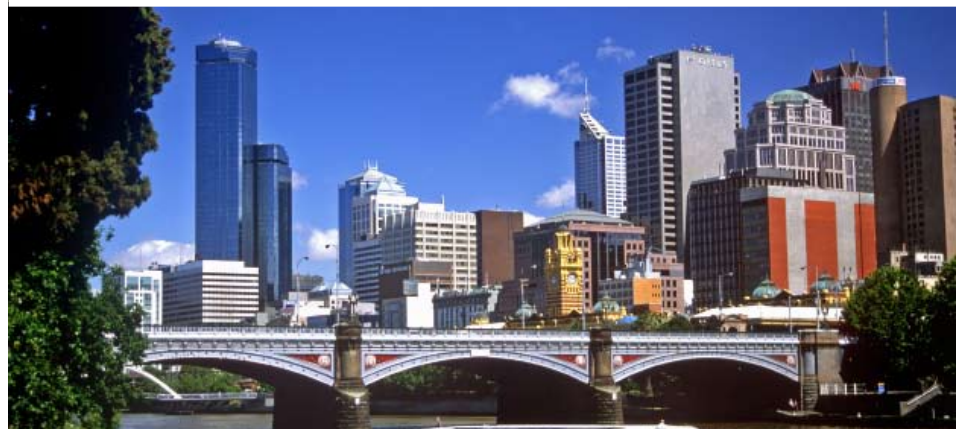
City of Melbourne