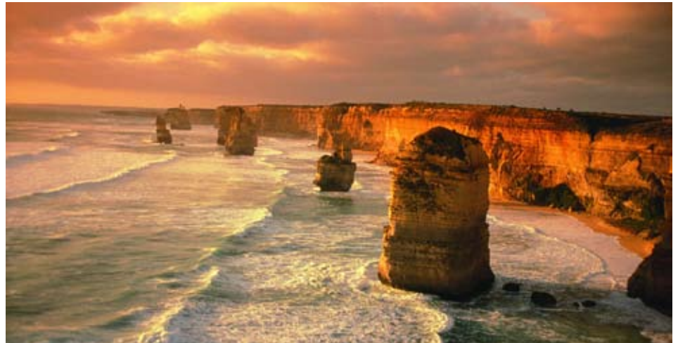
Chance to see the famous 12 Apostles at Great Ocean Road

After an American breakfast, the rest of the day is at leisure for you to relax OR join us on an optional excursion to the Great Ocean Road. Enjoy spectacular views over golden surf beaches, sheer cliff faces and magnificent stands of Eucalyptus. The Great Ocean Road hugs the coastline along the entire length of Port Campbell National Park. See the famous 'Twelve Apostles' – huge stone pillars rising from the surf, remnants