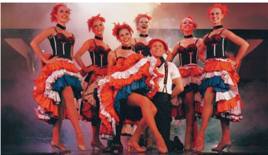
The Spectacular Showboat dinner cruise

An unforgettable experience to Green Island – a beautiful coral cay on Australia's Great Barrier Reef.