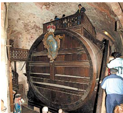
World's Largest Wine Barrel 'Tun' – Heidelberg