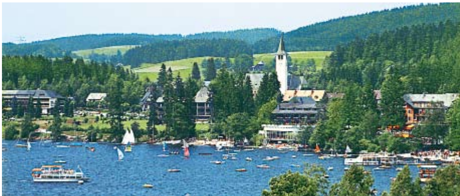
The heart of Black Forest – Titisee

Overnight at hotel Best Western Hofgutsternen / Alemannenhof / Maritim or similar, in Black Forest.