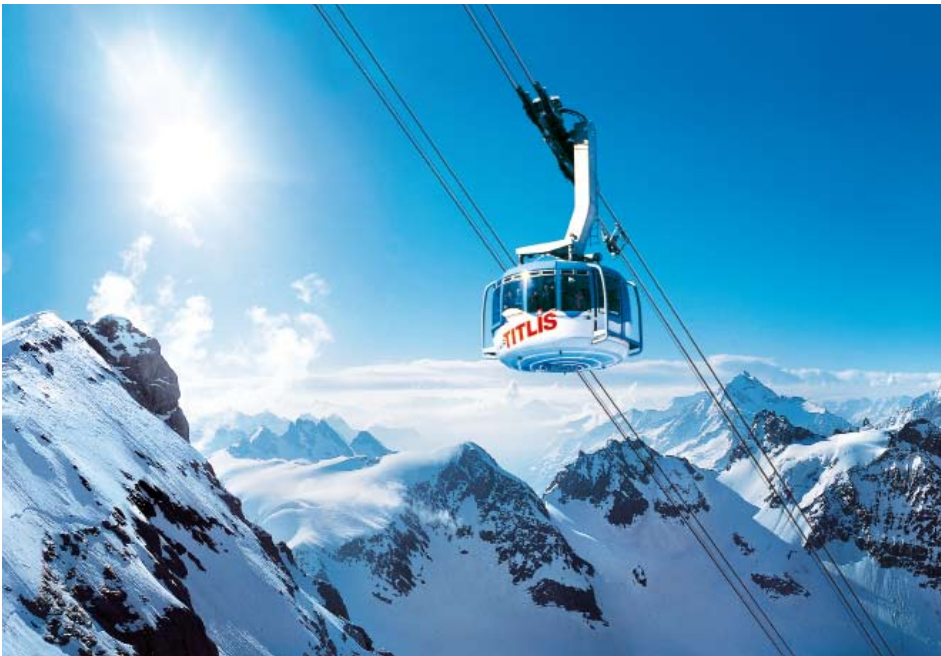
Revolving cable car – Mt. Titlis