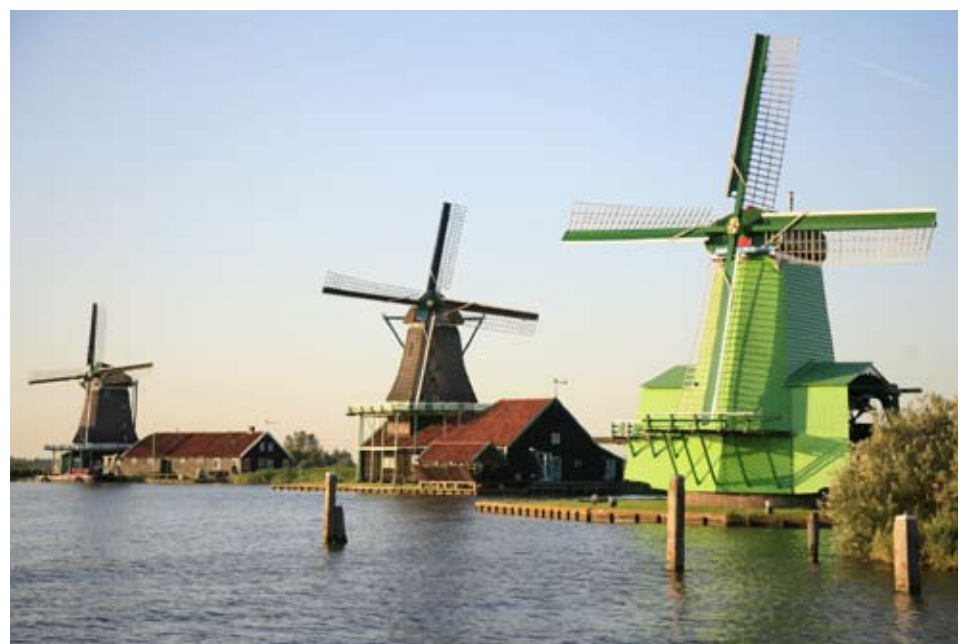
Zaanse Schans – The Netherlands