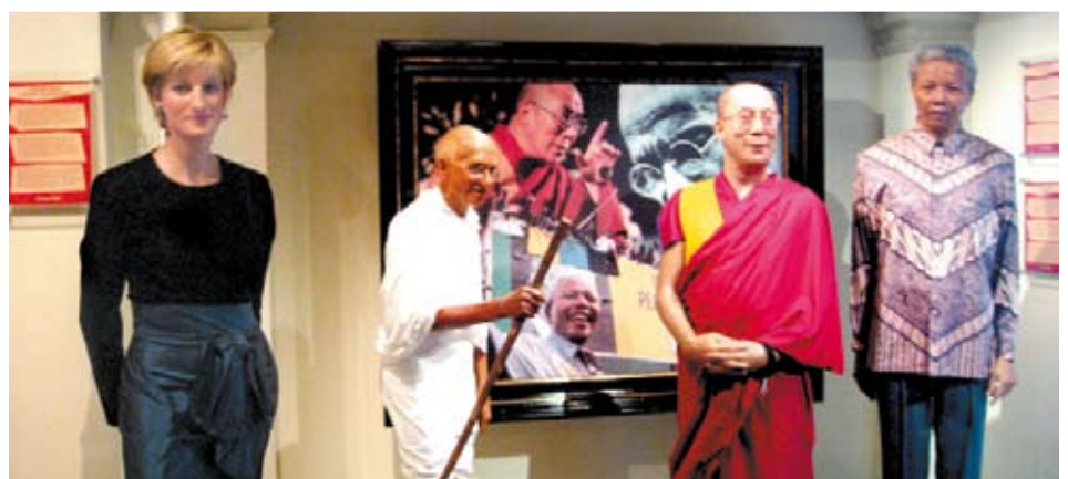
Madame Tussauds Wax Museum