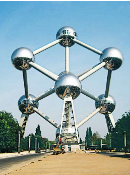
The Atomium – Brussels