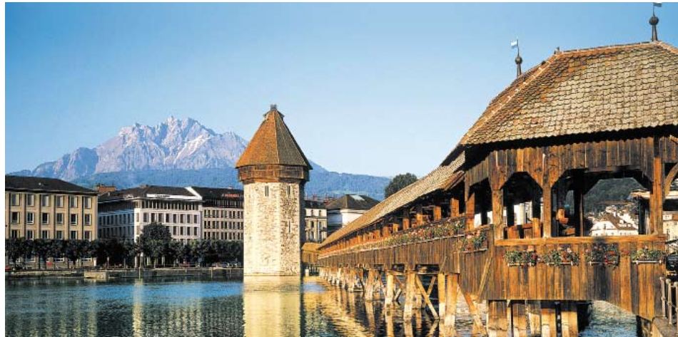
The unique Kapell Brücke – Lucerne

Overnight at hotel Schweizerhof / Ramada /