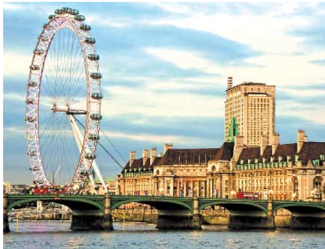
Spectacular London Eye

City tour of London. Visit Madam Tussauds Wax Museum. Visit Tower of London.