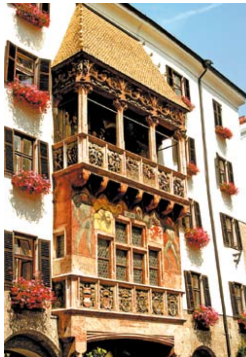
The Golden Roof - Innsbruck