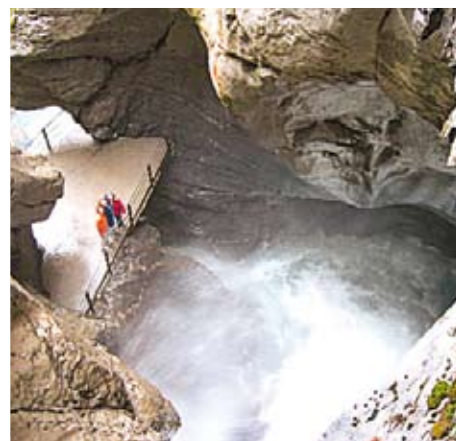
Thundering Glacial Falls – Trummelbach Falls

Edelweiss / Flora or similar, in Engelberg / Lucerne / Weggis.