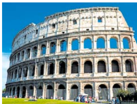
The Colosseum - Rome