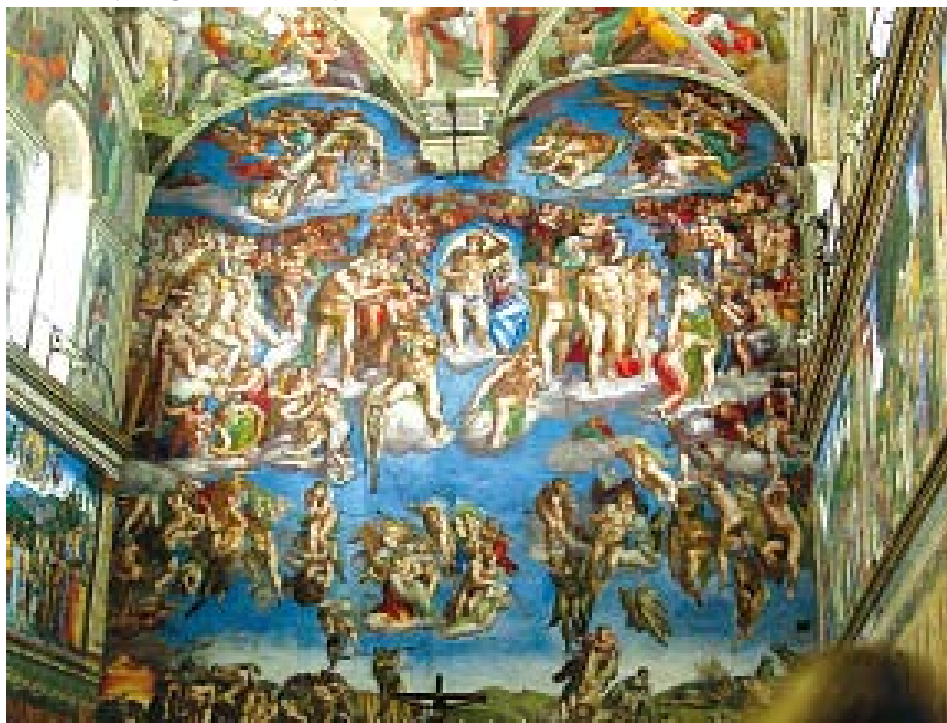
The beautiful paintings in the Sistine Chapel - The Vatican

After a buffet breakfast, proceed on a full day guided excursion to Cannes, Monaco and Monte Carlo.