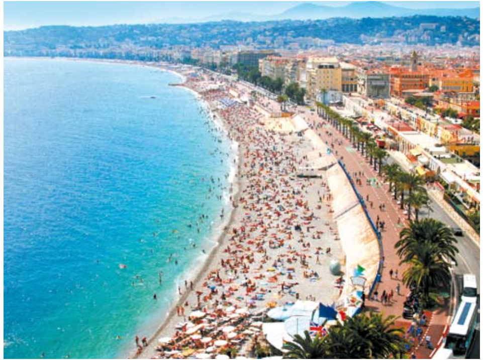
'Queen of the French Riviera' – Nice

After a buffet breakfast proceed to the airport (on your own) for your flight back home. Return home with great experiences and wonderful memories of your holiday.