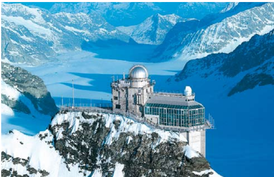
Top of Europe – Jungfrauoch

Mt Titlis - A landscape close to heaven. Lucerne – Orientation Tour. Gala Dinner