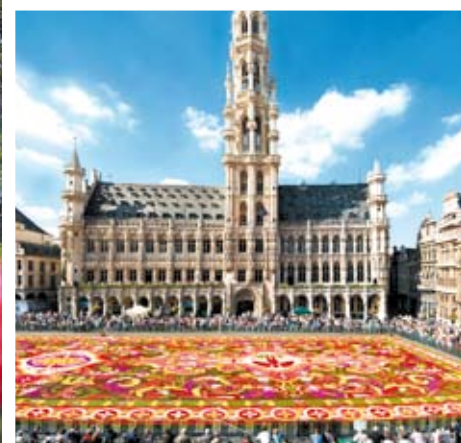
Grand Place - Brussels