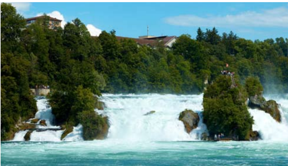
Rhine Falls - The largest waterfall in Europe