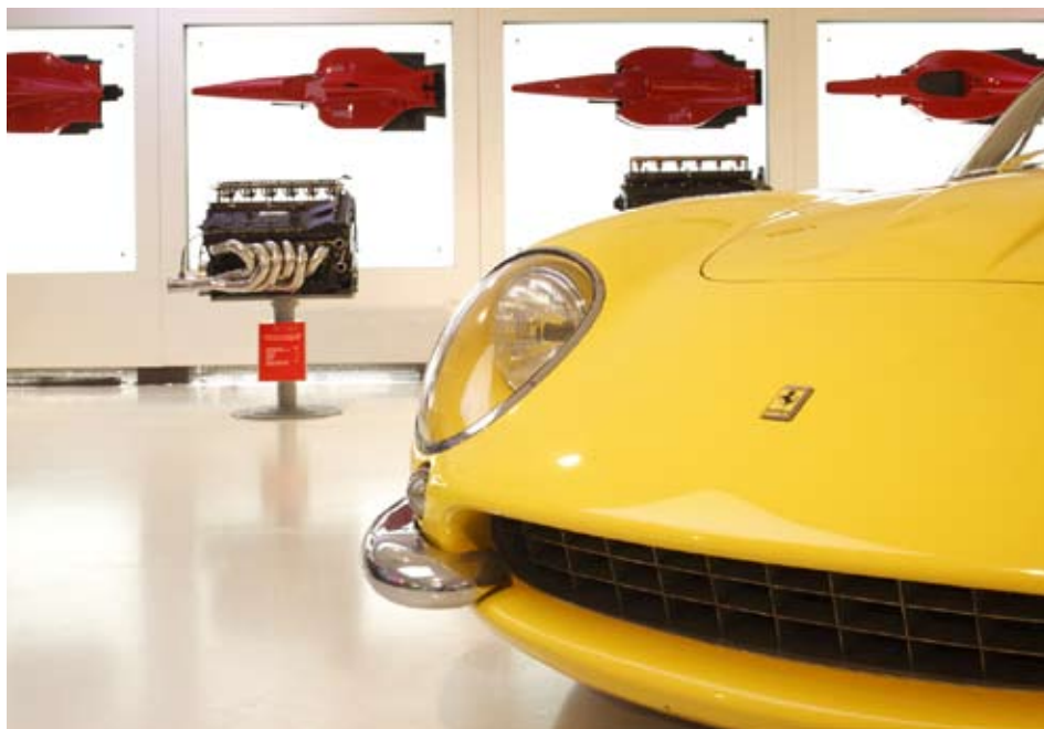
The unique Ferrari Galleria Museum - Maranello

After a buffet breakfast, check out and proceed to the romantic city of Venice. Board your chartered boat to the traditional centre of the city - Piazza San Marco. Today, enjoy an Indian lunch on board your chartered boat. This city of 117 islands in the Venetian Lagoon is sure to leave you mystified. See the St. Mark's Basilica, Bridge of Sighs, the