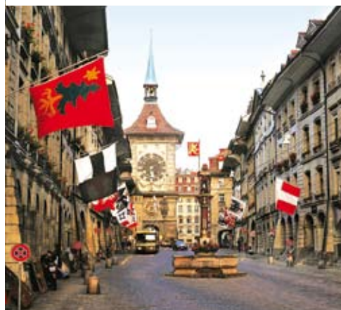
UNESCO World Heritage City – Bern