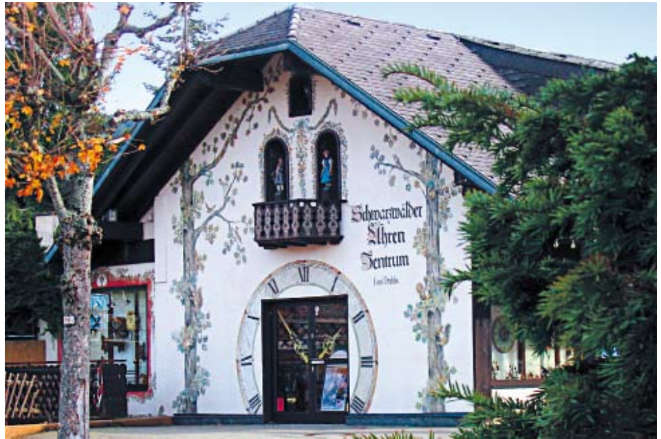
Home of the Cuckoo Clocks, in the heart of the Black Forest

After an Indian lunch, proceed to the quaint village of Boppard, located in the central