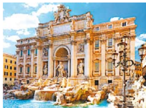
The majestic Trevi Fountain - Rome

expose you to beautiful sights like the opulent Colosseum, the Victor Emmanuel Monument, Roman Forum, Circus Maximus and ancient temples and many more sights.