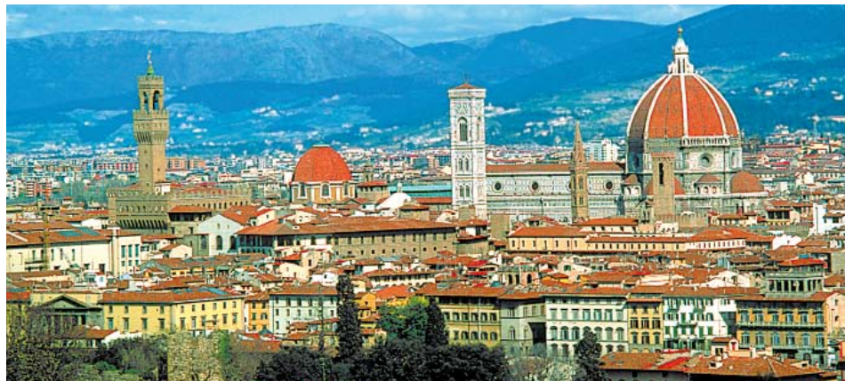
Florence - The home of Renaissance

After an Indian lunch, your city tour will