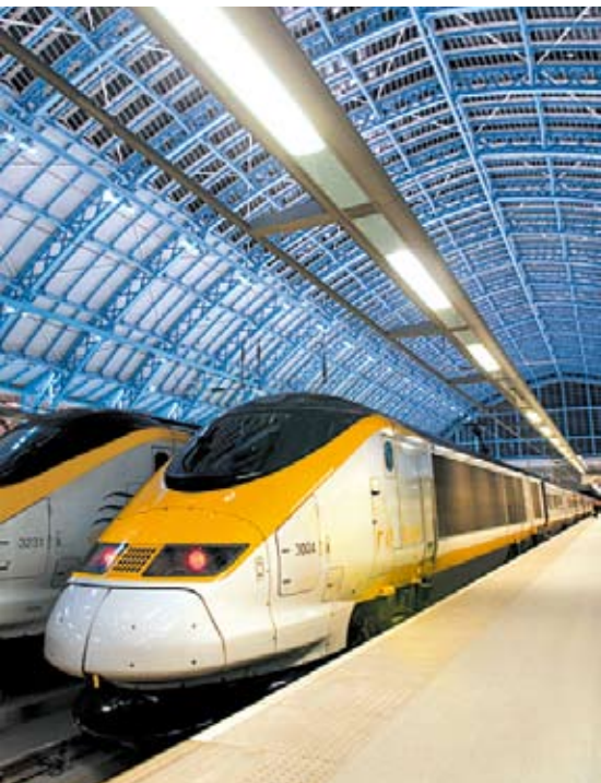
The Channel train 'Eurostar'