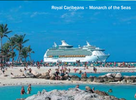
Royal Caribbeans – Monarch of the Seas