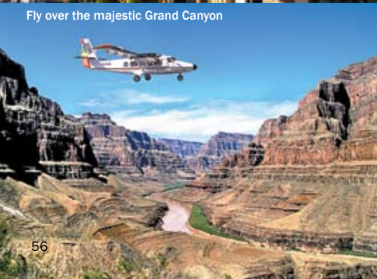
Fly over the majestic Grand Canyon

enjoy a spectacular Broadway-style Show on board.