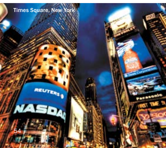
Times Square, New York

Onto Washington D.C. Visit the Smithsonian Air and Space Museum. Guided city tour.