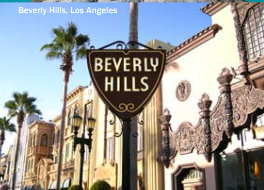
Beverly Hills, Los Angeles